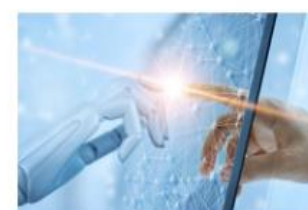
Online classroom and education