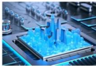
New smart cities and parks