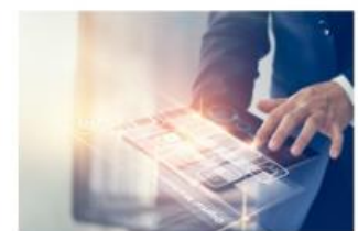
Remote office and online activities