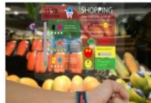
Fresh food e-commerce