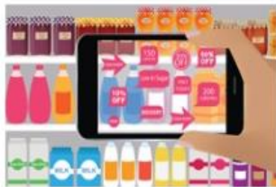
Unmanned commerce and services