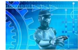
Manufacturing and service robots