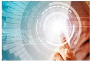
Digital platforms and big data

Acceleration of the China+1 global supply chain strategy