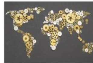
Supply chain management