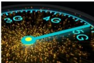
5G industry applications