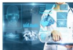
Online healthcare services